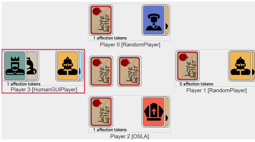
Figure 1: GUI for Love Letter , red line shows current player.

in a map structure in order to provide access to them using their unique IDs, while a deck is an ordered collection with specific interactions available (e.g. shuffle, draw, etc.). Both areas and decks are considered components themselves.